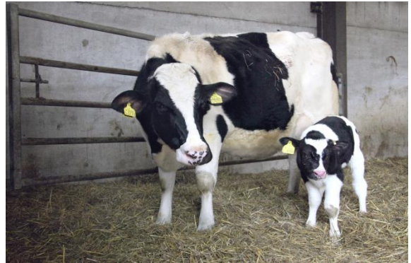
Cow and calf standing in a straw yard