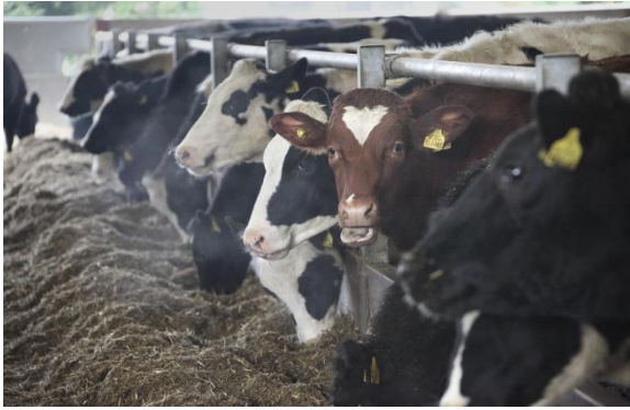
Cows eating from the feed passage