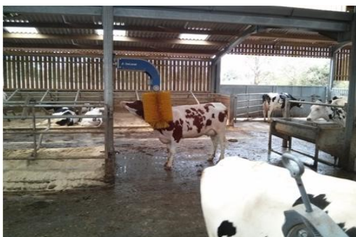
Cow using a cow brush